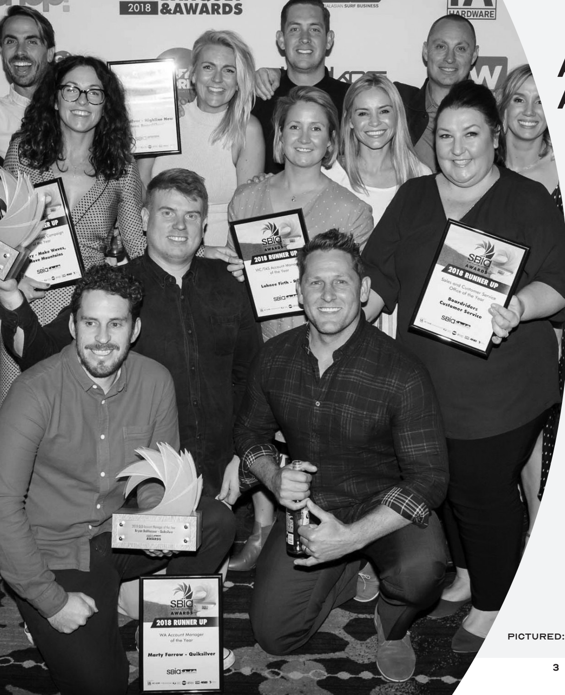
PICTURED: TEAM QUIKSILVER